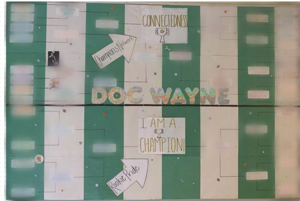
INTERPRETATION OF THE CREATING CHAMPIONS™ AND ROOKIE PRIDE™ BRACKET CREATED BY THE VILLAGE