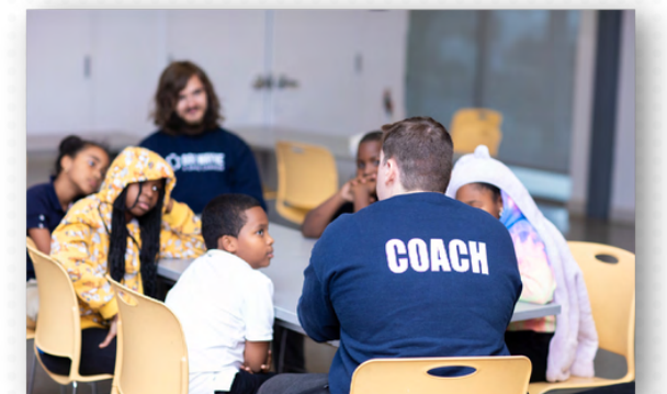
Coaches and youth warm up inside after a few games.