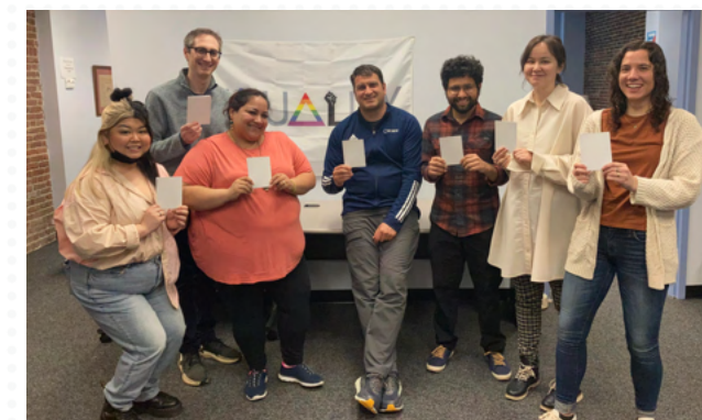
"WHITE CARD" FOR PEACE THROUGH SPORT