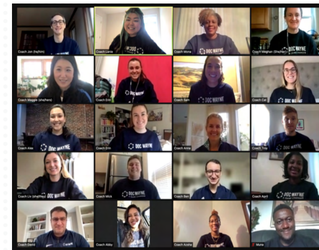
VIRTUAL TEAM MEETING IN 2021